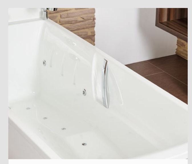
Large armrests with high quality handles offer safety and comfort to bathers