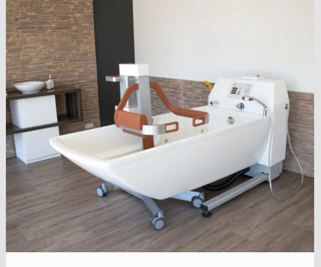
Accessible from 3 sides with all modern lifters