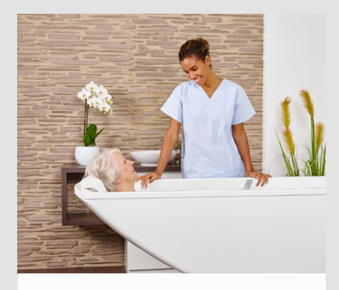
Great arm and shoulder room