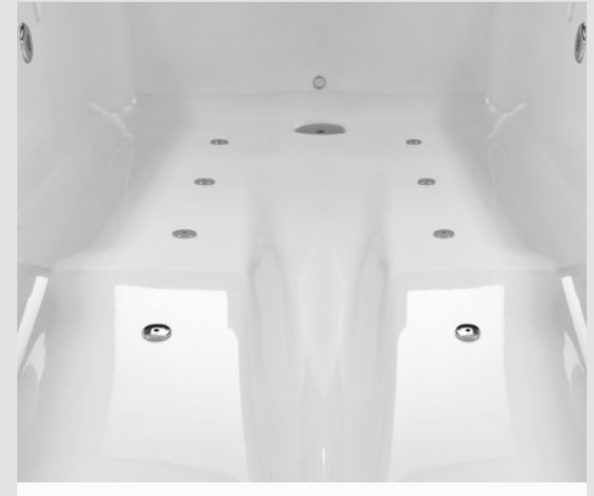
The lowered foot area supports ergonomic lying and prevents slipping