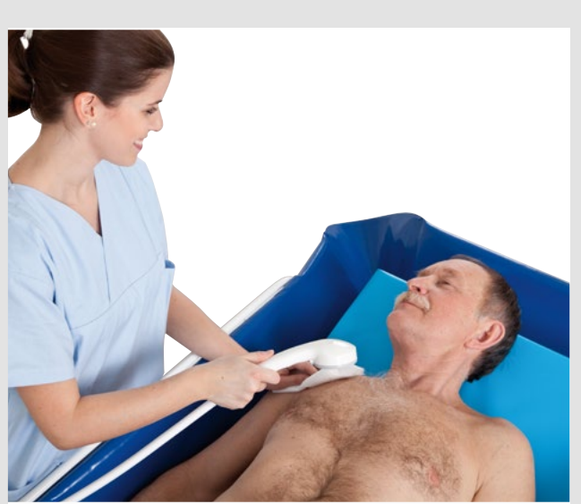
Pleasantly padded lying surface for comfortable showering, optional head wedge for even better comfort