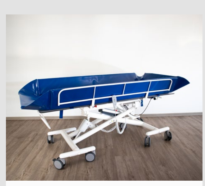
SINA XXL - extremely stable design for bariatric patients up to 250 kg