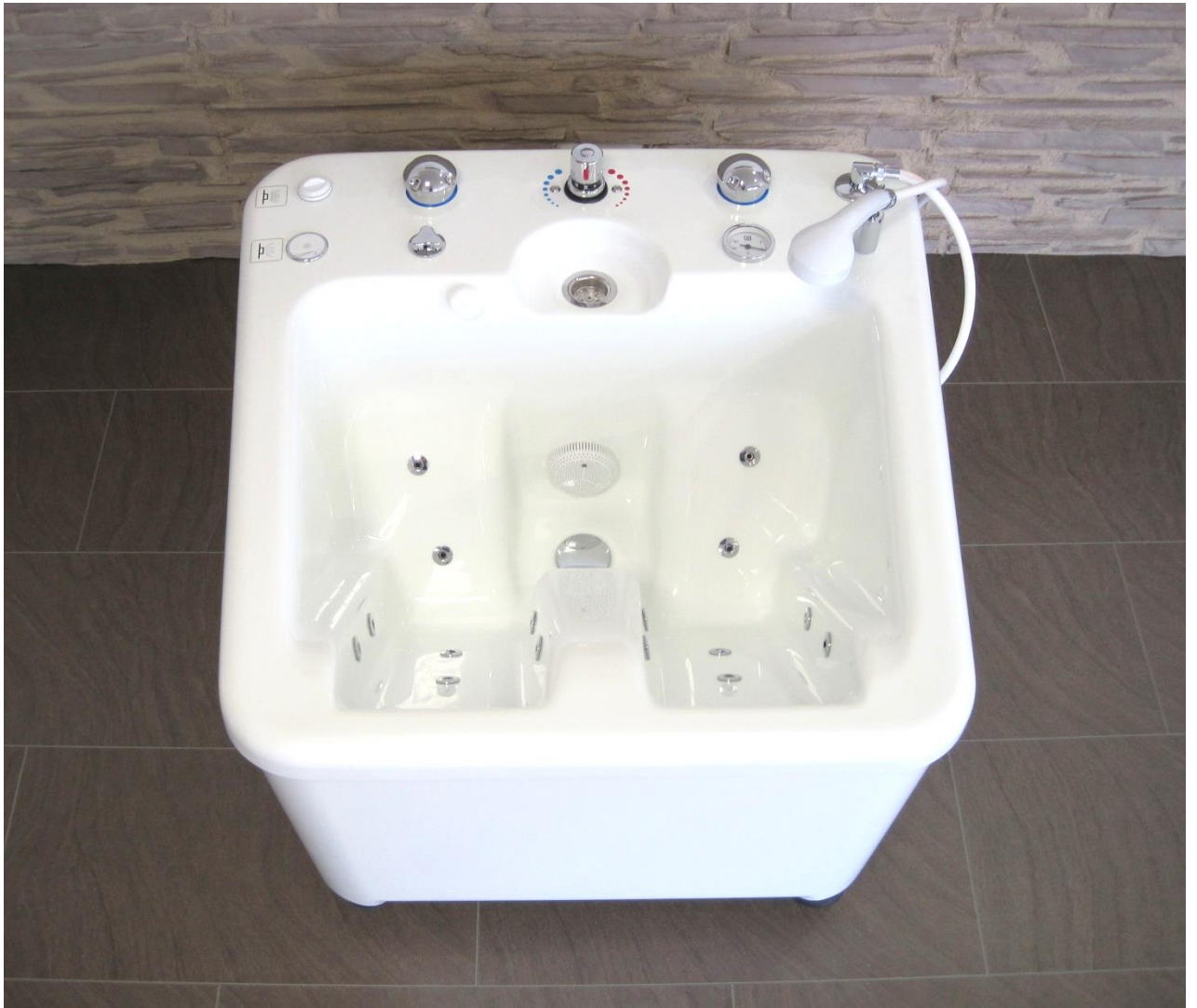
Hydro-Airjet foot-bath II