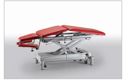
MANIPULAT 3 G Three-part treatment table. Middle and foot part gas-spring supported, positive adjustable by 35°.