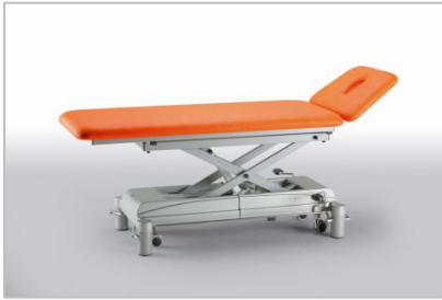
MANIPULAT 2 Two-part treatment table. Head part positive up to +40° and negative up to -70° adjustable.