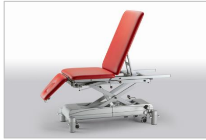
MANIPULAT 3 F Three-part treatment table. Foot part gas-spring supported, positive adjustable by 70°. Middle part is fixed.